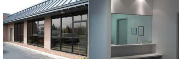
Exterior and interior views.